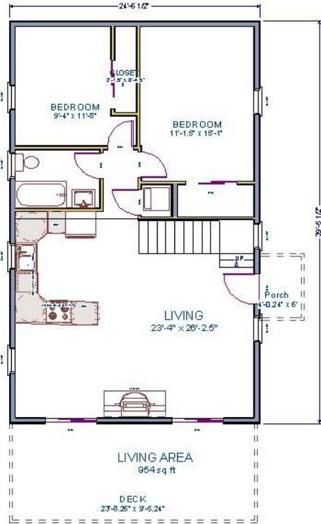
Main Floor 954 sq.ft.