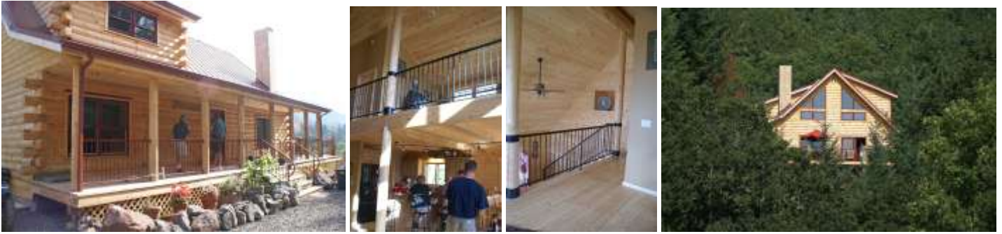
Streamside II 1755 sq.ft.