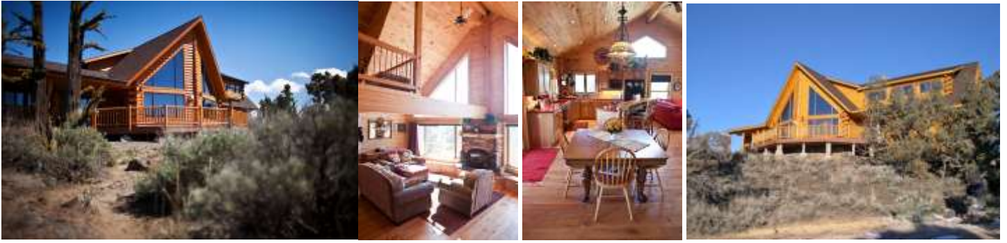
Riverside III 2582 sq.ft.