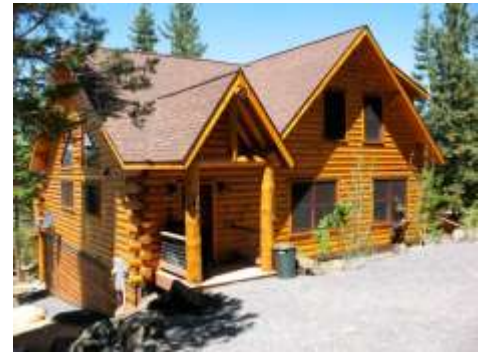
Riverside I 1740 sq.ft.