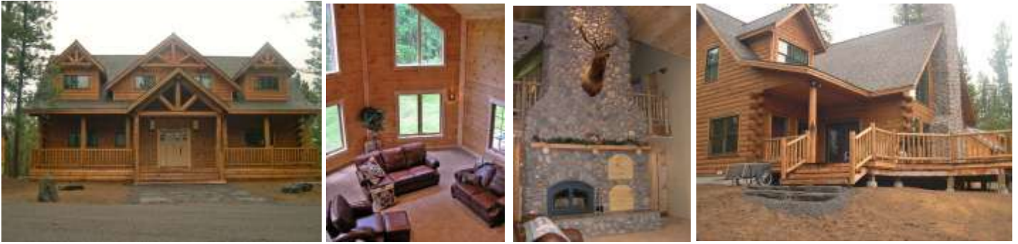
Lakeside III 2737 sq.ft.