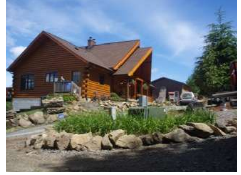
Lakeside II w/loft 1874 sq.ft.