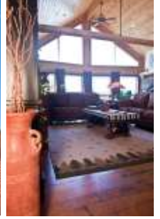
Creekside III 2318 sq.ft. Living & 28x24 Garage 672 sq.ft.