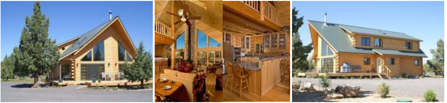
Brookside III 2197 sq.ft.