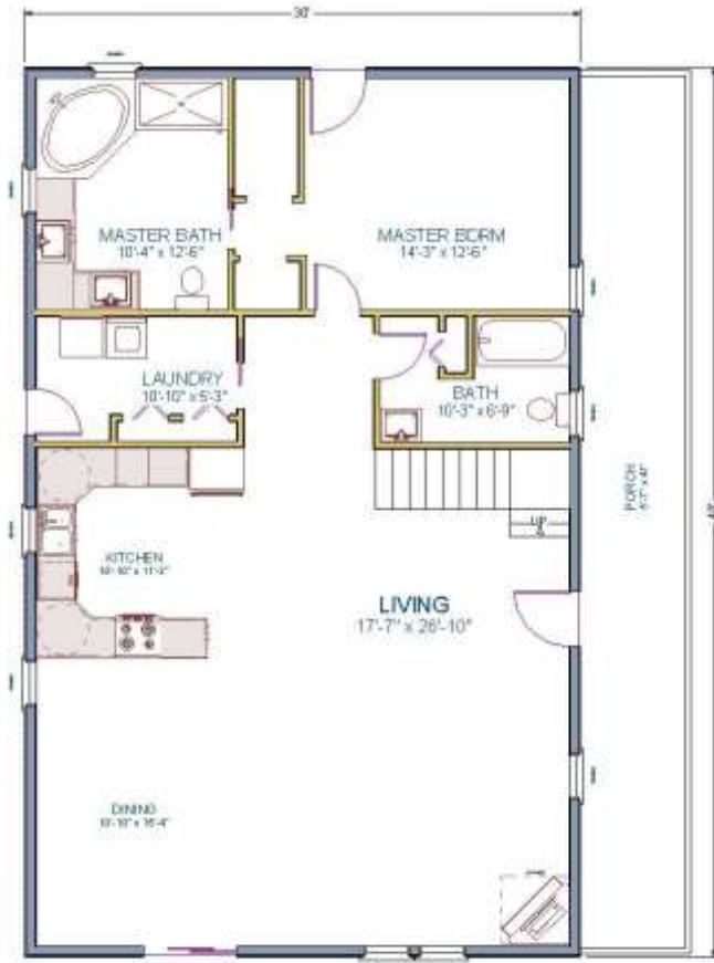
LIVING AREA 1424 sq ft.