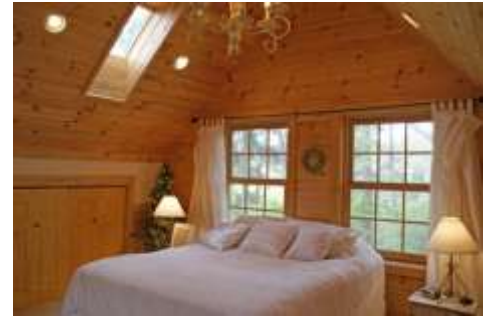
Brookside I 1239 sq.ft.