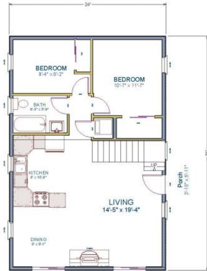
LIVING AREA 850 sq ft